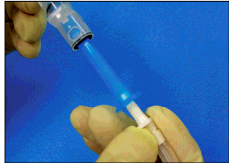
KS-VF connected to the irrigating tube.

Recently, the safety of cataract surgery has improved markedly by virtue of advances in surgical techniques and equipment. It is expected to improve not only the efficiency of surgery itself but also reduce surgical costs considerably. Safer and smoother surgery with the Visco-Free Preloaded Injector emancipates patients from both physical and mental strain; it is promising and truly ideal for all concerned.